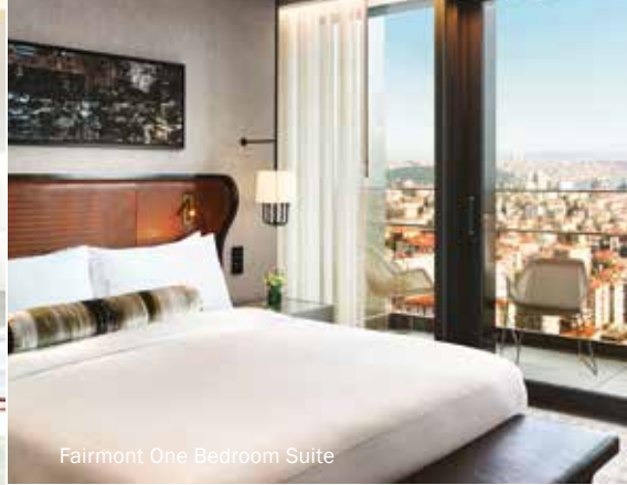
Fairmont One Bedroom Suite